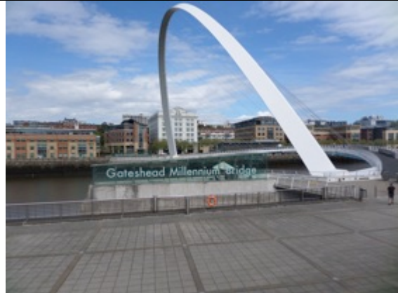
Baltic Square, start and finish