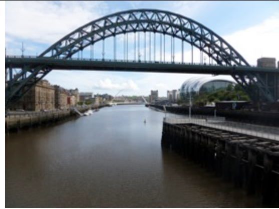
The timed mile circuit