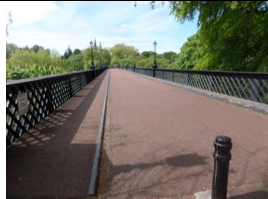
Cath's sprint and put the chocolate coins in the tub on Armstrong Bridge