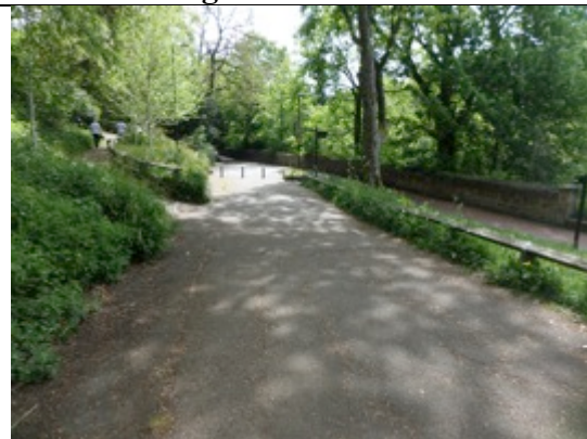
Cath's hill in Jesmond Dene