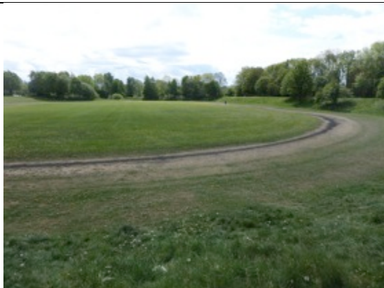
Home of the Rose Hawkswood Beer Mile